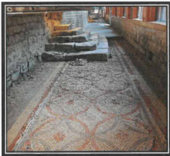
Roman mosaics inside Chedworth

Last term, pupils from Year 3 and Year 4 of Bidford on Avon School attended a school trip to Chedworth Roman Villa. This was to give them the opportunity to allow themselves to have a greater understanding regarding their topic for this term - the Romans.